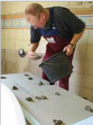
■ Dots of LUX ELEMENTS®-COL-AK fixing adhesive are applied on the rear of the cladding where the holes have been drilled.