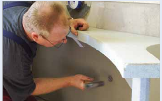
■ Then the cladding is glued with its rear side to the wall and anchored with LUX ELEMENTS®-FIX-FID 130 hammer fix plugs.