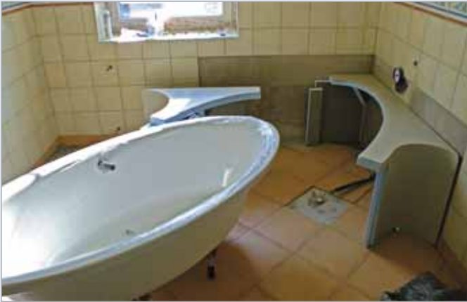
■ The elliptical shaped bath tub is installed into one corner with its full length protruding into the room.