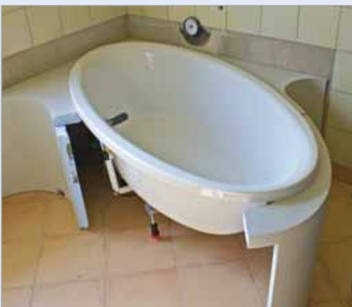
■ The bath tub is inserted when all fixed parts are anchored. The pipes are connected afterwards and the remaining loose elements are glued to the elements anchored on the wall. The right adhesive LUX ELEMENTS®-COL-PU is used for this.