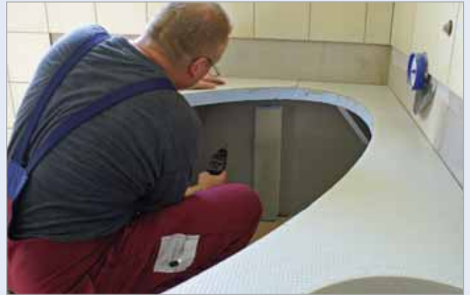
■ Then the holes are pre-drilled through the cladding after which it is removed and the holes are drilled fully.