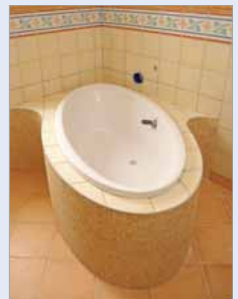
■ The bath tub surround after installation and tiling.