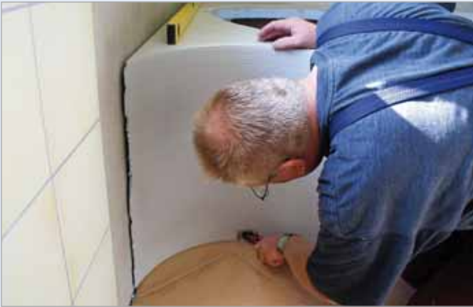
■ The height adjustment of the cladding elements is made with the help of adjustable feet.