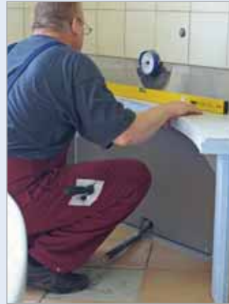
■ Step by step installation: The craftsman level the prefabricated parts with a spirit level. He checks the dimensional and fitting accuracy.